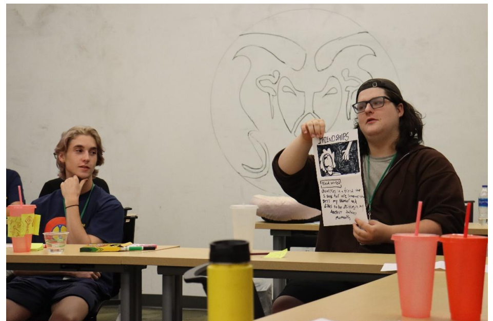
Figure 20: Two delegates at desks, one watching the other person present a drawing