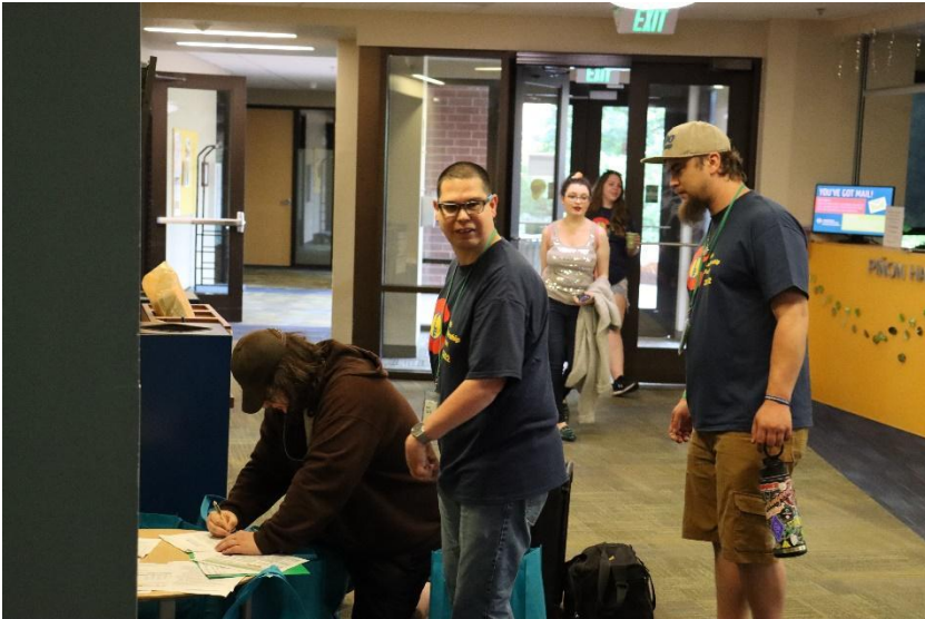
Figure 5: Three delegates coming into lobby, with one person writing at a small desk. Two staff looking on.