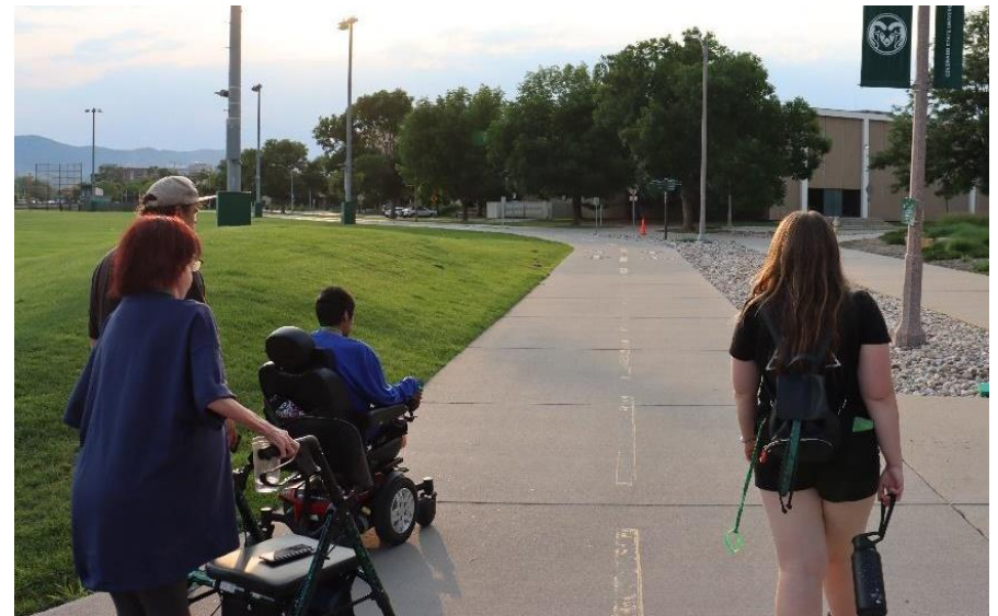
Figure 4: Four staff walking away across the CSU campus