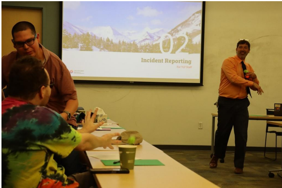
Figure 3: DSE staff is throwing things from the front of the room to demonstrate an "incident," two staff are at a table with one trying to catch