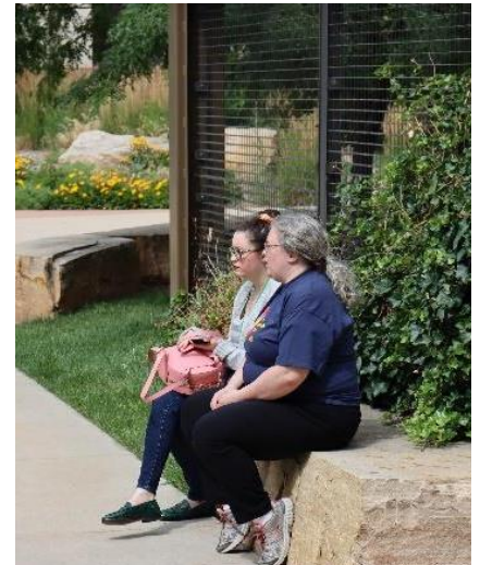
Figure 12: Volunteer and delegate sitting on a stone ledge talking outdoors