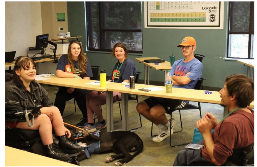
Figure 28: Staff and delegates interacting and smiling with presenter