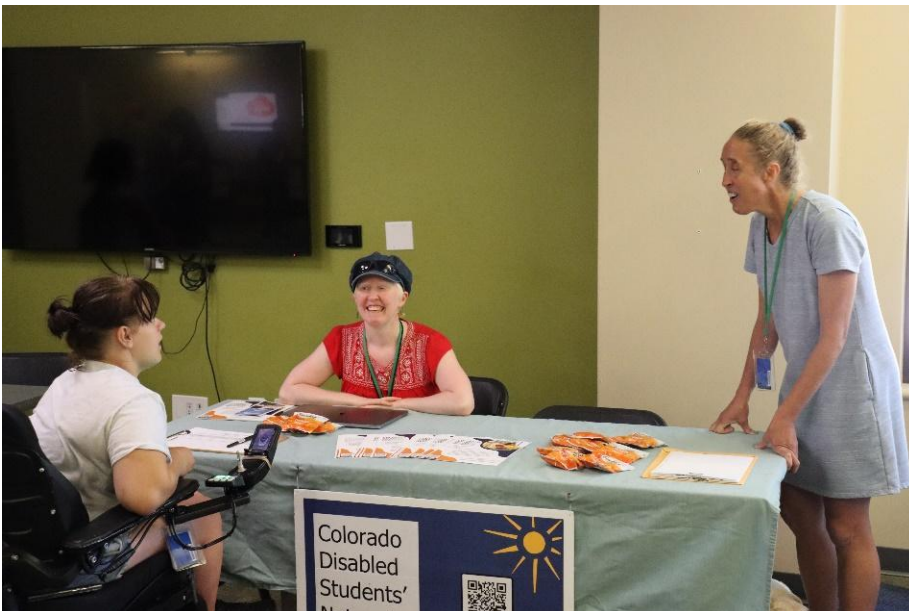
Figure 39: Delegate talking with two Resource vendors