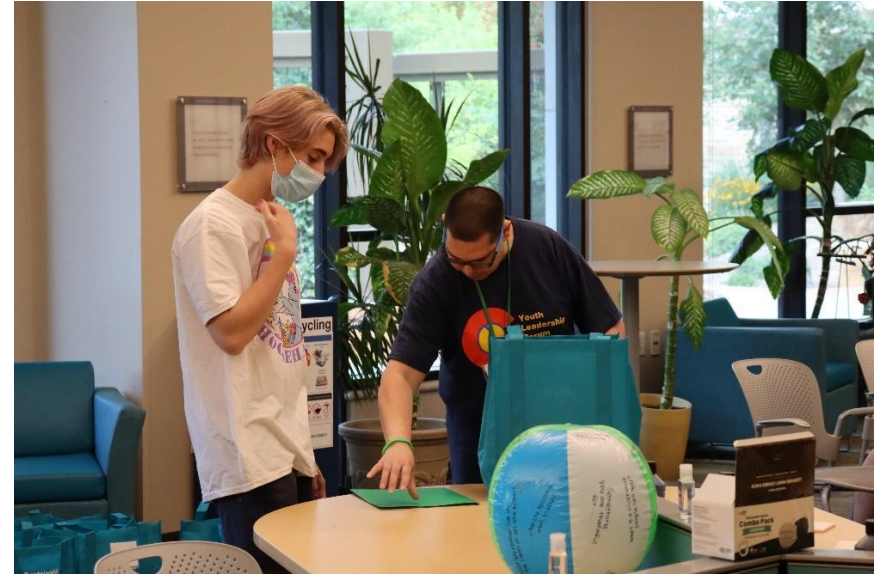
Figure 5: A delegate looking at something a staff person is showing on a round desk