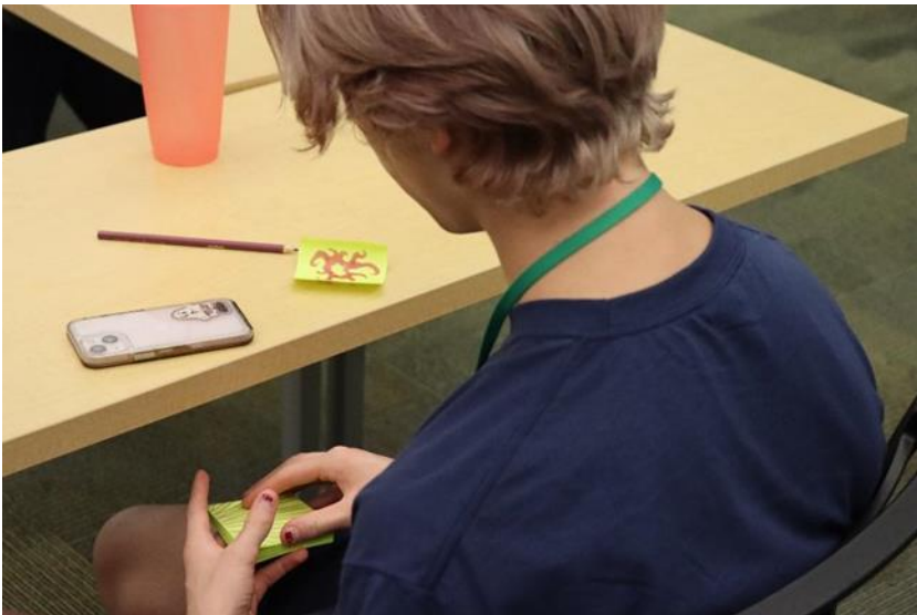
Figure 15: Delegate sitting at table with sticky pad of drawings, from back