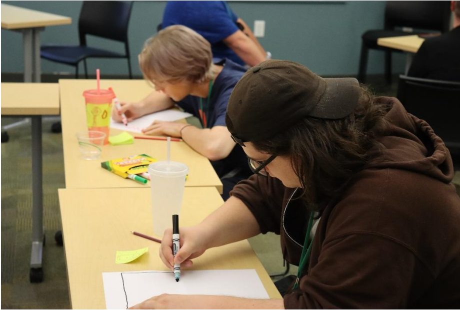
Figure 17: Two delegates working with markers and paper, next to each other