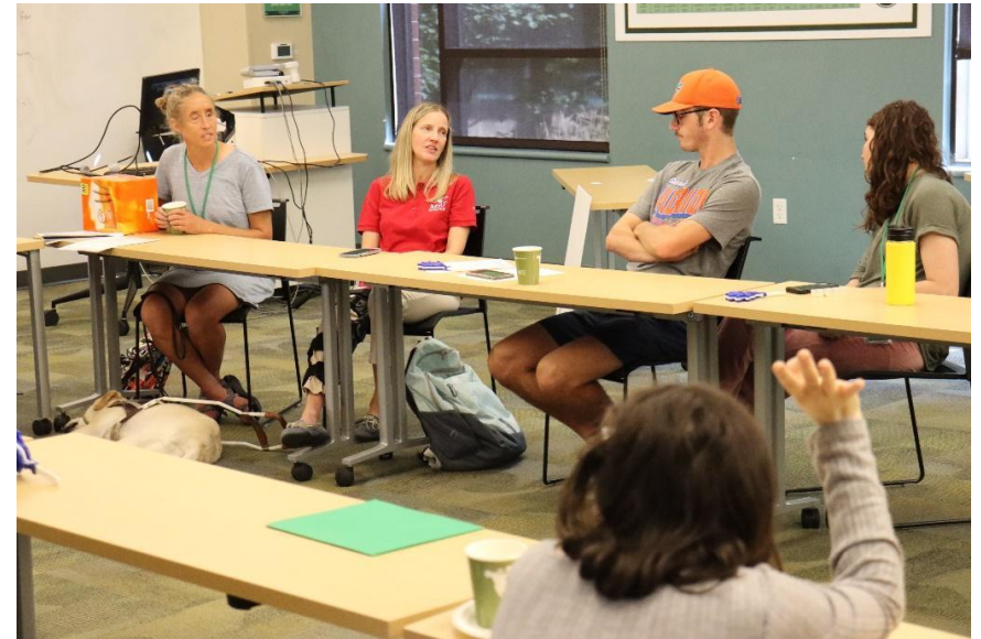
Figure 34: Group of delegates, one with hand raised, interacting with presenters