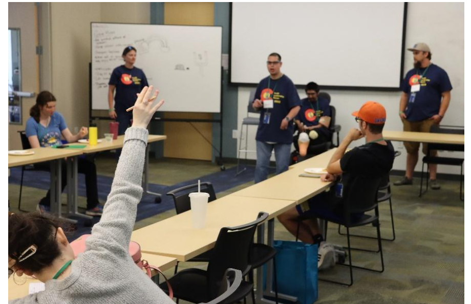
Figure 16: Group of staff and delegates interacting in a classroom, with one person raising their hand