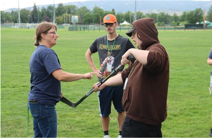
Figure 21: Delegates learning how to use a hockey stick