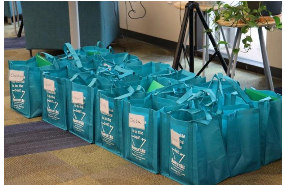
Figure 2: Rows of big blue goodie bags for the delegate