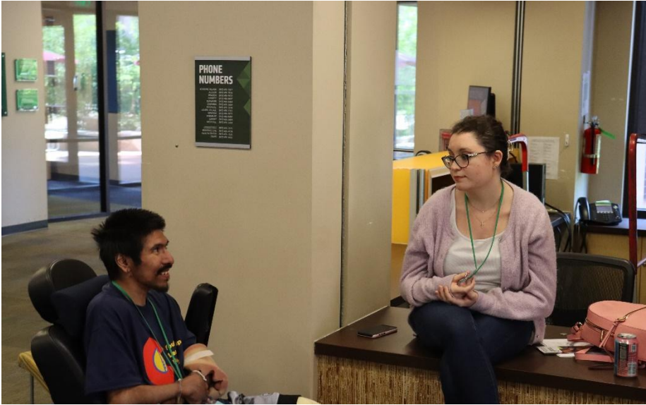
Figure 41: Delegate and staff talking