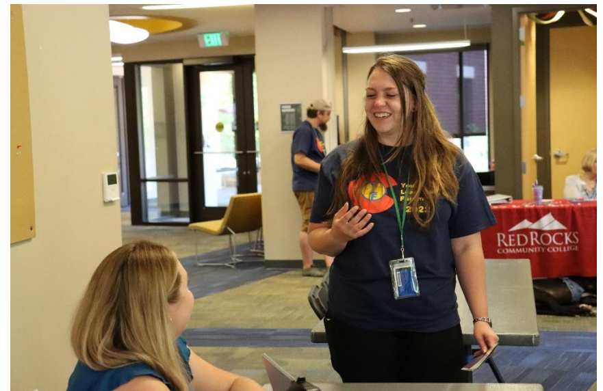
Figure 40: Staff laughing with Resource Fair Vendor