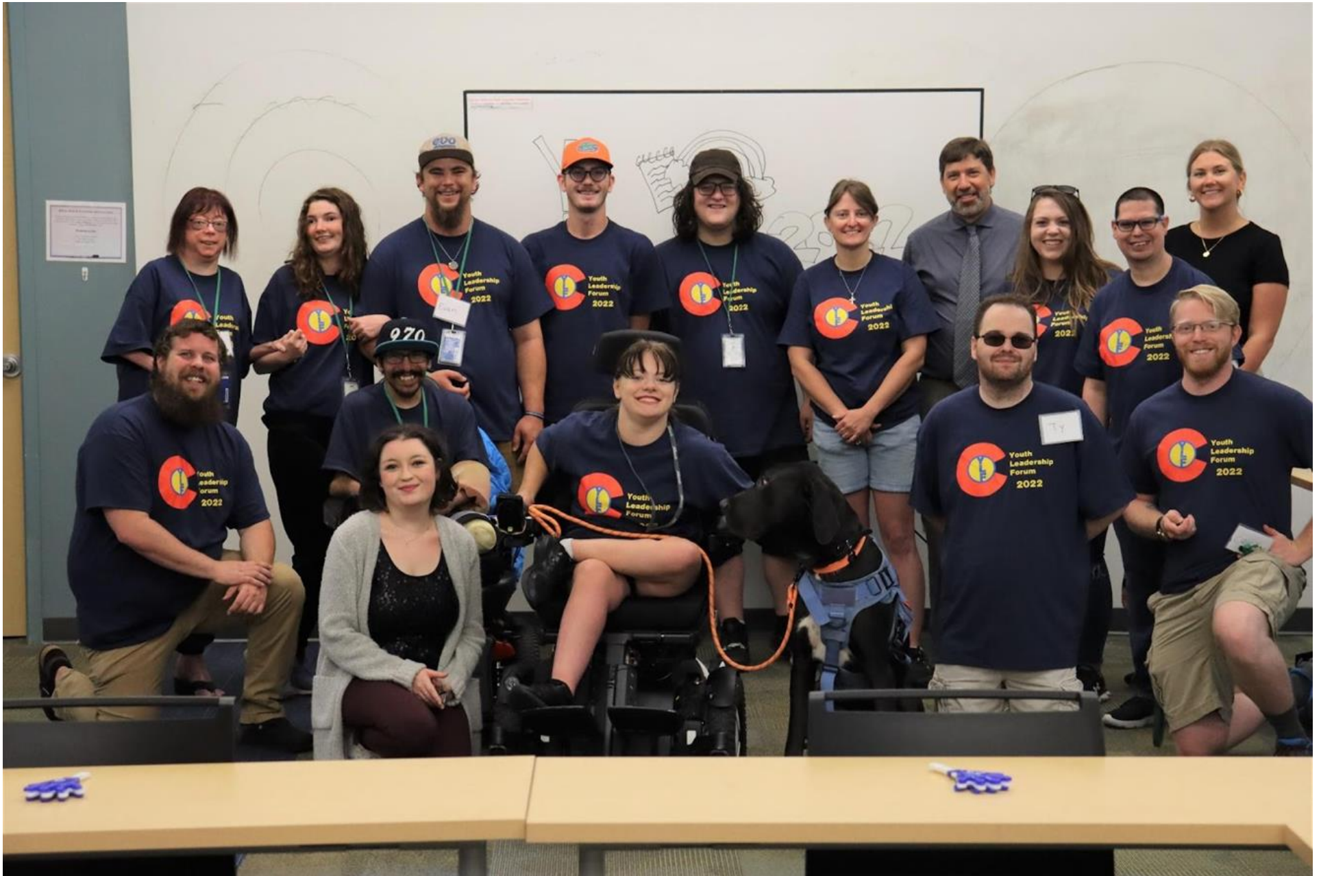
Figure 45: Group photo of delegates, volunteers, staff, and DSE