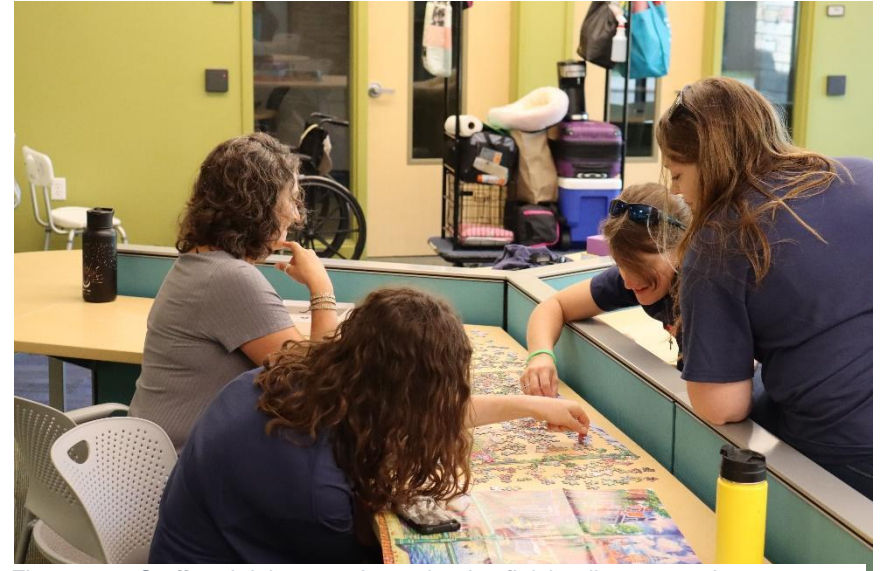
Figure 42: 1Staff and delegates determined to finish a jigsaw puzzle