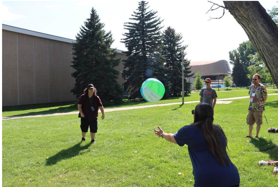
Figure 43: Delegates and staff playing with a large beach ball outside in the courtyard