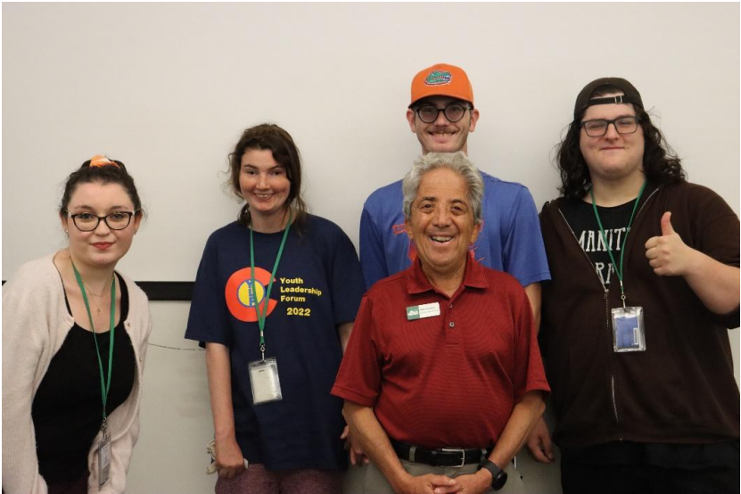
Figure 30: Delegate group picture with Commissioner Kefalas