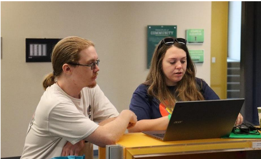
Figure 6: staff and delegate sitting at a desk looking at a computer