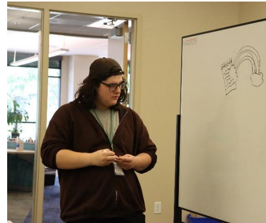
Figure 11: Delegate standing next to whiteboard using graphic facilitation