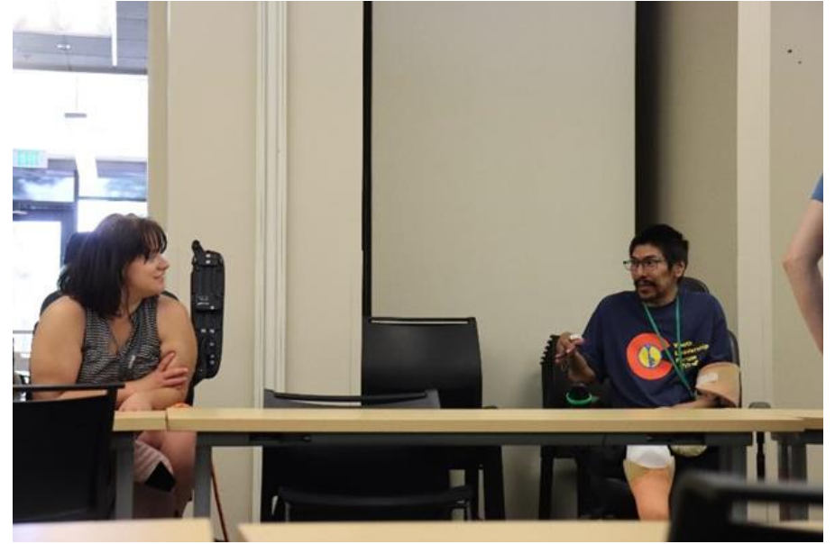
Figure 14: Staff and delegate talking and smiling at a table