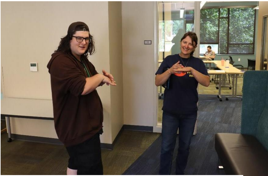
Figure 35: Delegate practicing ASL with staff