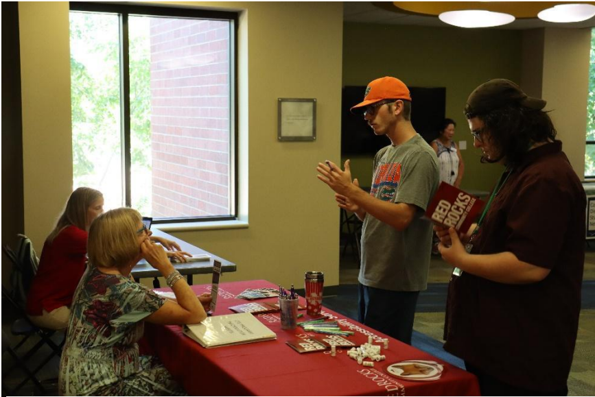
Figure 37: Two delegates interacting with Resource Fair vendors