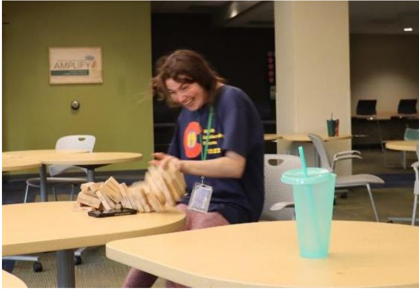
Figure 32: The two-foot pile of Jenga blocks falls over