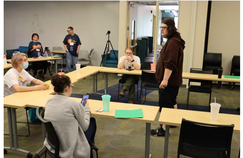
Figure 9: Group of delegates listening to a speaker, with two staff in the background