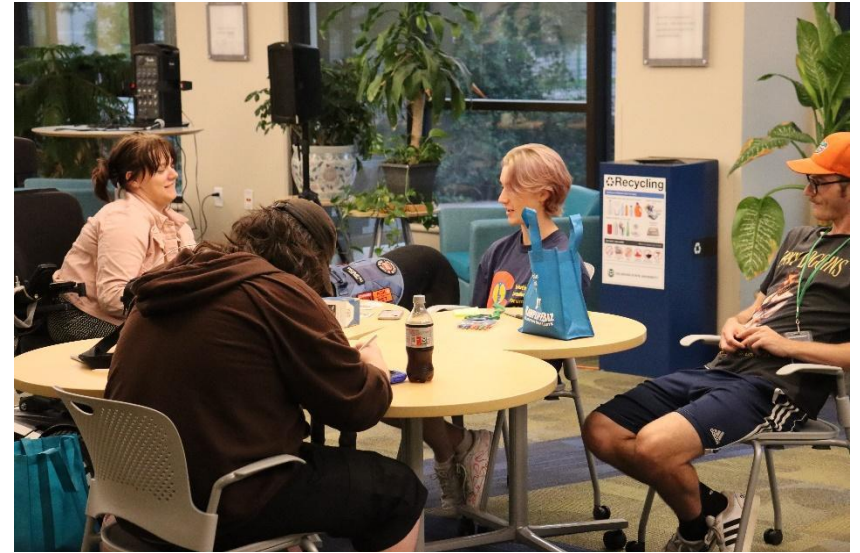
Figure 22: Delegates interacting and smiling around a table