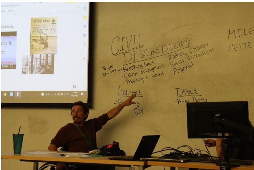
Figure 27: Presenter in a wheelchair discussing civil disobedience