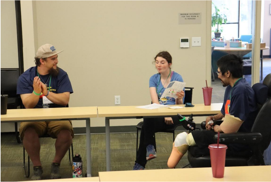
Figure 13: Two staff, one in a power chair, talking with a delegate at a table