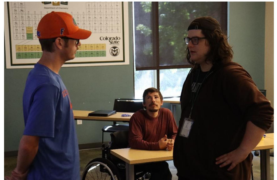
Figure 26: Two delegates doing an improv with the presenter watching from a table