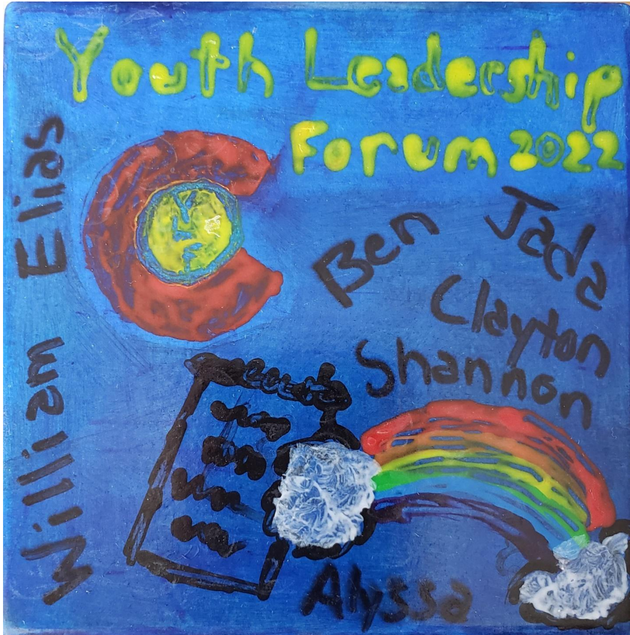
Figure 1: Picture of our YLF logo - a C for Colorado with YLF sun in the middle, and a rainbow bursting out of a pad of paper with names of delegates

Colorado Statewide Independent Living Council Youth Committee