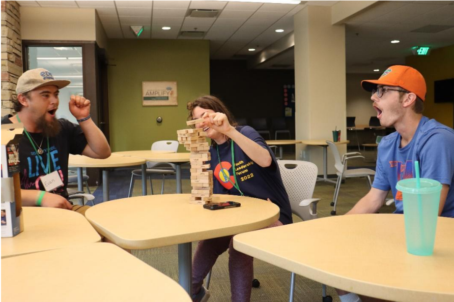
Figure 31: Two delegates and a staff member playing Jenga