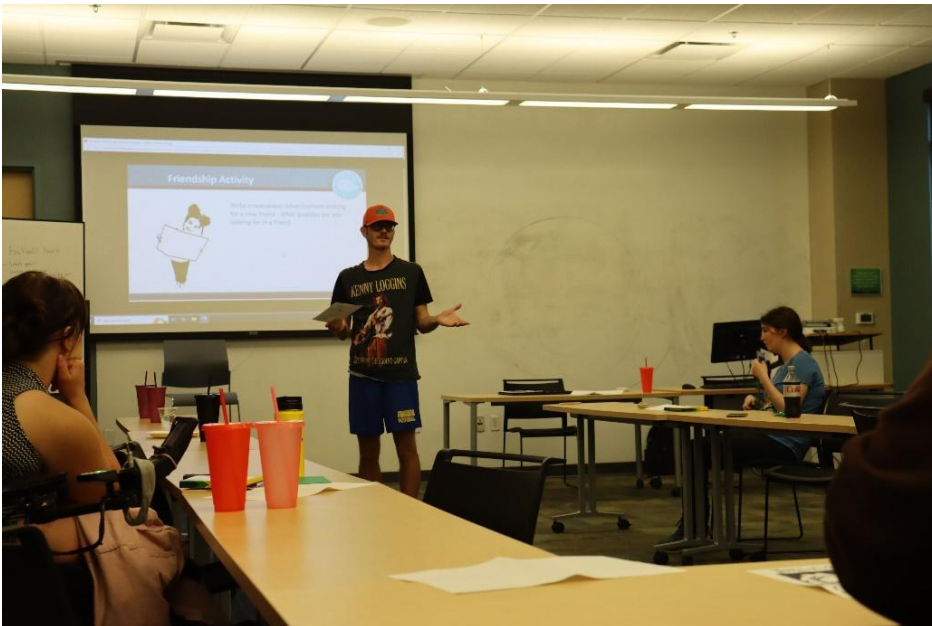
Figure 19: Delegate speaking in front of classroom of other delegates