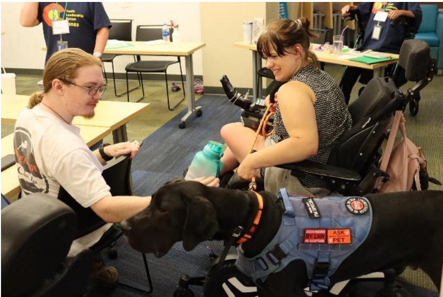
Figure 10: Black Great Dane service dog with delegate in wheelchair, sitting with another delegate at a table. Both are smiling.