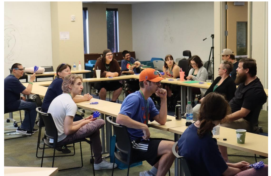
Figure 24: Delegates and staff sitting at tables watching a presenter