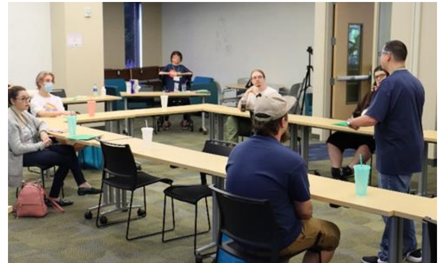
Figure 7: Delegates sitting at tables listening to a speaker. Volunteer watching from back of room.