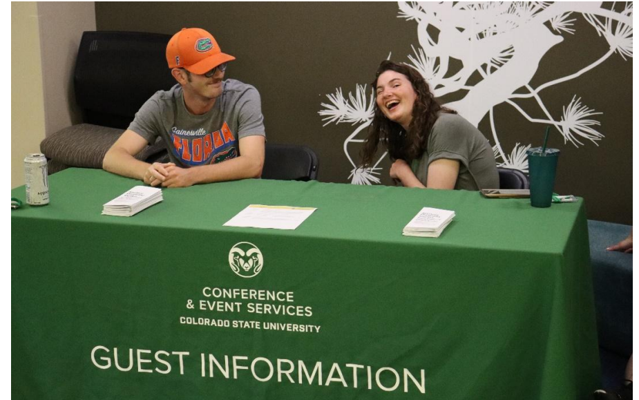
Figure 38: Two delegates sharing a laugh