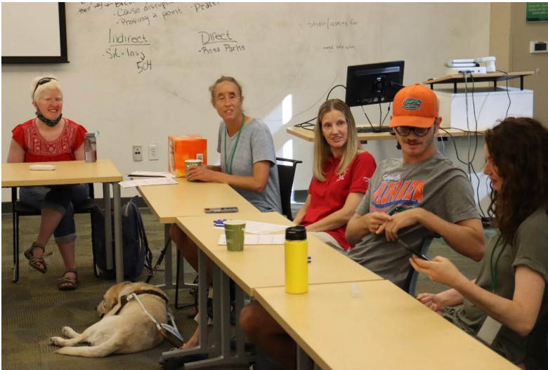
Figure 33: Group of delegates talking and laughing at a table