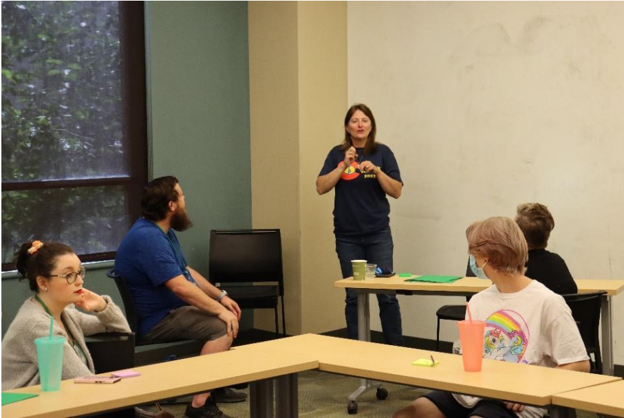
Figure 8: Volunteer using ASL, in front of a classroom of listening delegates