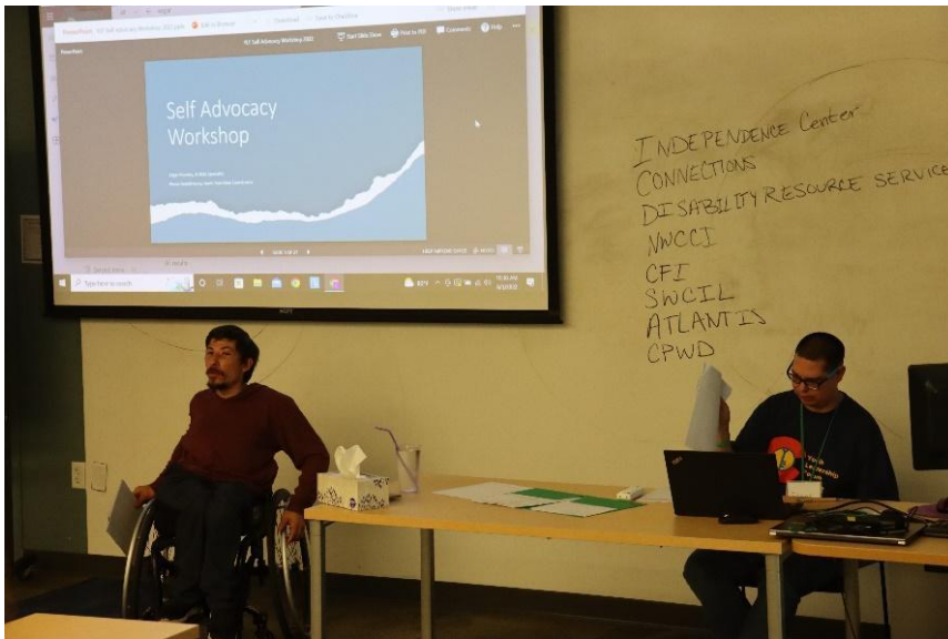
Figure 25: A volunteer and a staff giving a presentation about self-advocacy