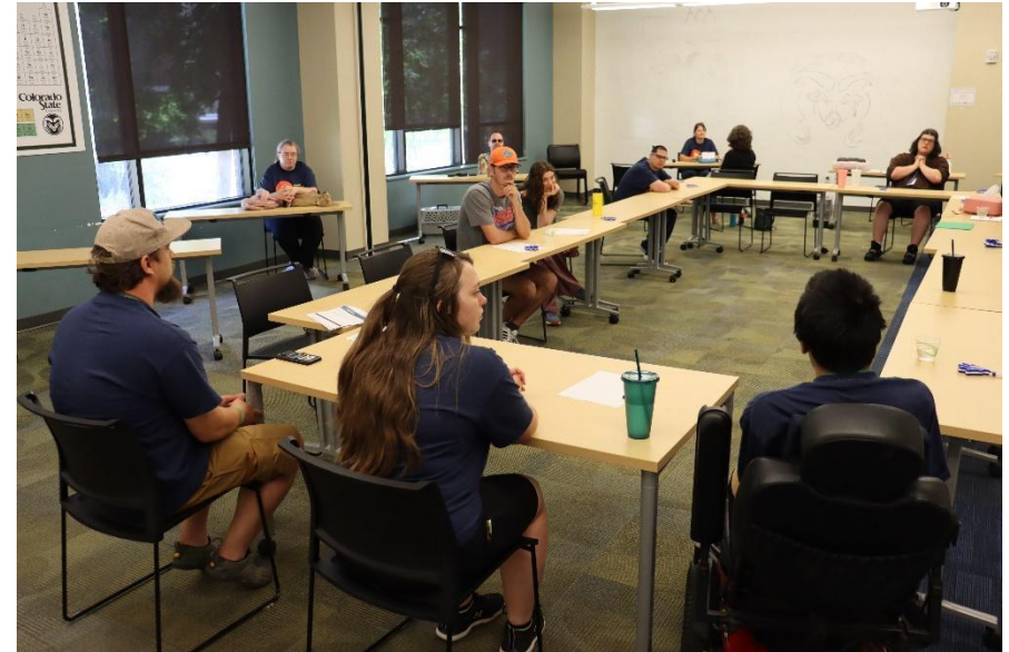
Figure 36: Delegates in classroom listening and interacting with panel of staff